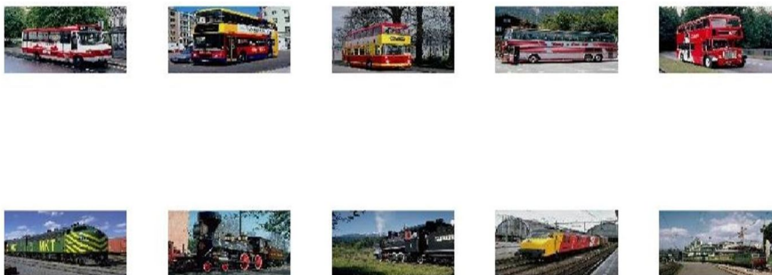
Fig.3 result of image retrieval process (query image = 'BUS category')