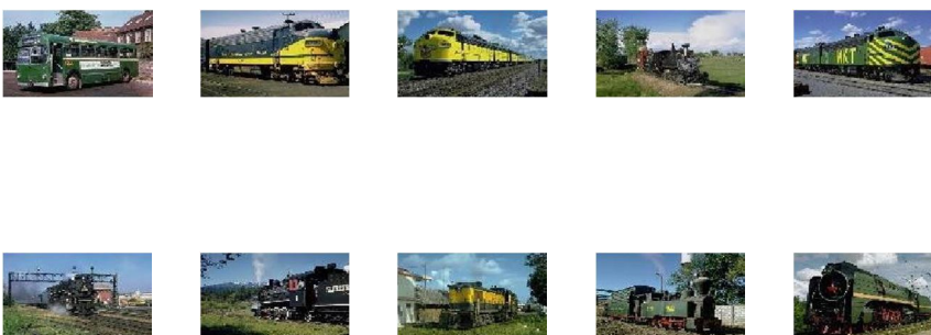
Fig.4 result of image retrieval process (query image = 'TRAIN category')