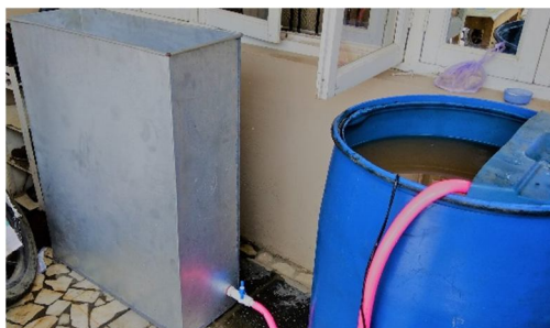
Fig- (c) tube settler model.