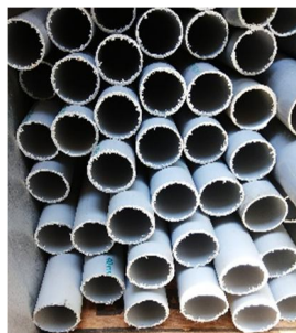
Fig- (d) test arrangement of tubes in the tank.