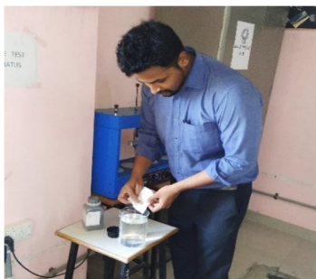
Fig- (b) test for coagulation dose (jar test).