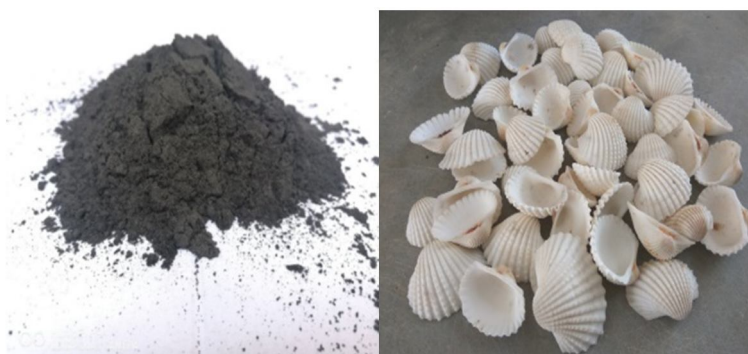
Fig 3.1 Sea shell and Corn cob ash