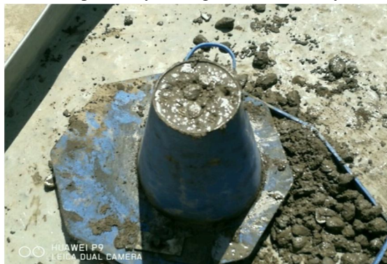
Fig 4.1 Slump Cone Test