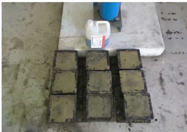
Fig 4.2 Conventional Cubes