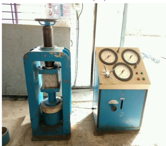
Fig 4.3 Compressive Strength Test