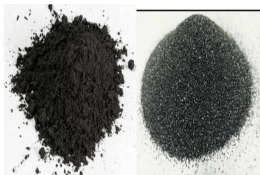
Fig 3.1 prosopis juliflora ash and steel slag