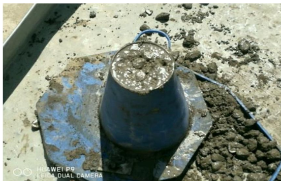
Fig 4.1 Slump Cone Test