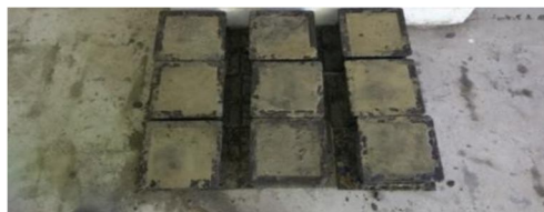
Fig 4.2 Conventional Cubes

Similarly, for each test that was conducted, the total number of 30 cylinders were prepared of size 150x300mm. The specimens were casted by using mixture as that used for cube casting and cured for 28 days at normal temperature to determine the split tensile strength of concrete.