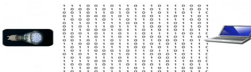
Figure 1: Data transmission in Li-Fi

Wi-Fi is a wireless technology based on IEEE 802.11 standard that use Radio Frequency waves i.e Electromagnetic waves to transmit the sensed data which is collected by the various sensors. Wi-Fi commonly uses 2.4 GHz – 5.8 GHz radio bands which work best for Light-of-Sight condition. Some common materials can absorb or reflect the radio waves that restrict the range of the signal. Wi-Fi use half duplex shared configuration where all station can transmit and receive the signal on the same channel. GSM (Global System for Mobile Communication) is a open, digital 2G cellular standard that provide data and voice services. It provides SMS, fax, voicemail, e-mail, incoming and outgoing call, video conferencing etc. It uses TDMA(Time Division Multiple Access) for transmission of data. TDMA allows multiple users to share the same frequency channel by dividing the channel into different time slots. The operating range of GSM is 900MHz to 1800 MHz and data transfer rate is upto 9.6 kbits/s. GSM divide the 200 KHz channel into 25 KHz channel of eight time slots.