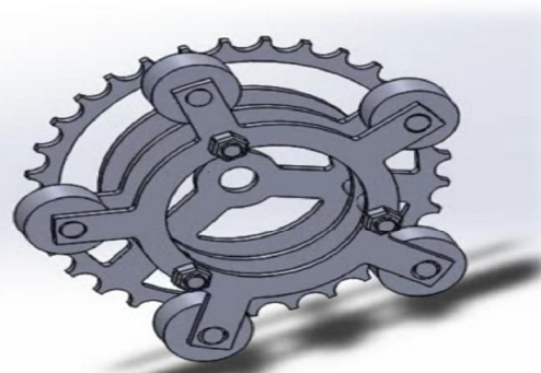
Fig 2: Front view of the attachment