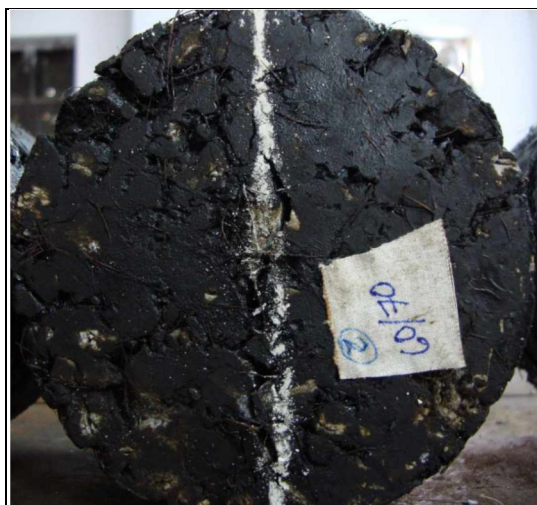
Fig 5.3 Specimen to be tested after adding coir fibre