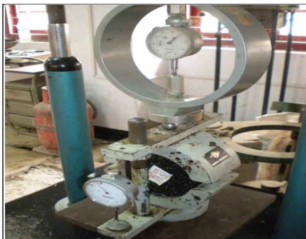
Figure 5.1 Marshall Stability Test in Progress