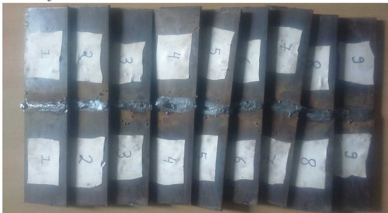
Fig. 1 Welded Work Pieces

The experimental layout is based on Taguchi's L9 orthogonal array. Nine number s of experiments are performed according to the design layout by using three levels of each process parameters. The welded pieces are shown in fig. 1. The observed values of ultimate tensile strength are tabulated in table 2.