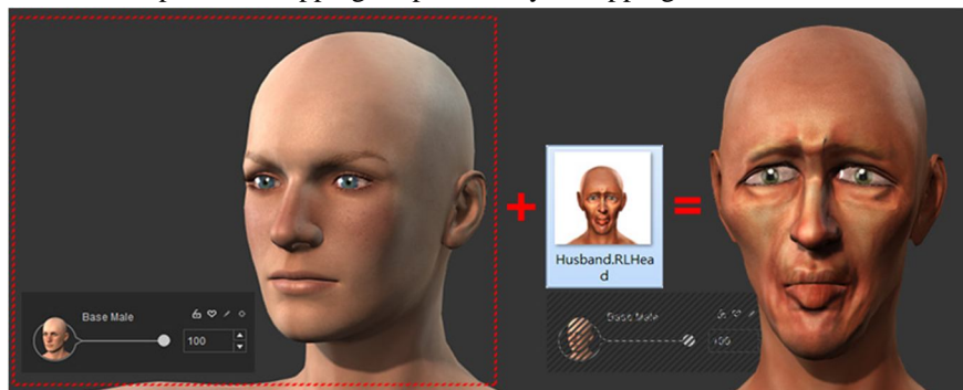
FIG .4 IMAGE MORPGING

Morphing is a technique in image processing that is used for the metamorphosis from one image to another. The main idea is to get a sequence of intermediate images which when put together with the original images would represent the change from one image to the other. It follows a simplest method of transforming one image into another is to cross-dissolve between them. In this method, the color of each pixel is interpolated over time from the first image value to the corresponding second image value and it is not so effective in suggesting the actual metamorphosis. In order to morphs between faces, the metamorphosis does not look good if the two faces do not have the same shape approximately. The morphing process consists of a warping stage before cross-dissolving so that the two images have the same shape. The wrapping is specified by a mapping between lines in the first and second images. [4]