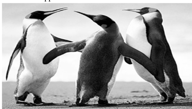
Fig.3.1 Representation Of Grayscale Image

When path information is not included in 'filename', 'imread' then it reads the file from the current directory. When an image from another directory had to be read, the path of the image has to be specified. Including semicolon at the end of a statement is used to suppress the output. If it is not included, MATLAB display the result of the operation specified in that line on the screen. >> indicated the beginning of a command line as it appears in the MATLAB command window