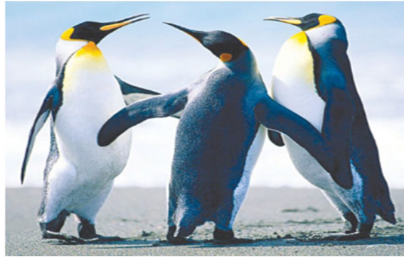
Fig. 3.2 representation of rgb image

Figs 3.1 and 3.2 show grayscale and RGB images of penguins, respectively. These images can be downloaded from the EFY website and it is stored in the current working directory. imread , imshow and imwrite functions in MATLAB are used to read images in MATLAB environment and display them on MATLAB desktop and write them to the current director. [2]