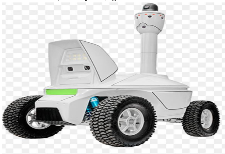
Fig. 1: Night vision robot Patrolling System

With the help of motor of the camera we can collect the information from all sides of the outside area. We can control the robot in two ways, one with the wire and the second is with wireless. The wireless controlling helps us to control the robot from different locations. In this GSM module is used and for camera support raspberry pie is used. Robot patrolling is mostly used in military area, hospitals, shopping mall, national functions, industry area, agricultural area etc.