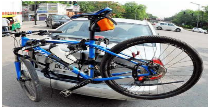
The ‘modal share’ of cycling in Delhi’s transport had reduced to about 4% .