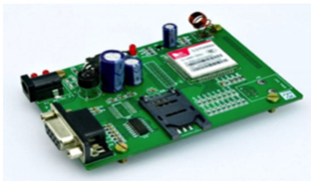
Fig.3 GSM Module

It is widely used mobile communication system in the world. GSM is an open and digital cellular technology used for transmitting mobile voice and data services operations.