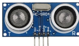
Fig.2 Ultrasonic Sensor

Ultrasonic sensor (shown in fig.2) is a very popular sensor used in many applications where measuring distance or sensing objects are required. The Ultrasonic transmitter could transmit an ultrasonic wave which travels in air and when it gets objected by any material or object it gets reflected back towards the sensor. The wave reflected back from the object is observed by the Ultrasonic receiver module. Considering the travel time and the speed of the sound the distance can be calculated. Here ultrasonic sensor is used for the purpose of obstacle detection.