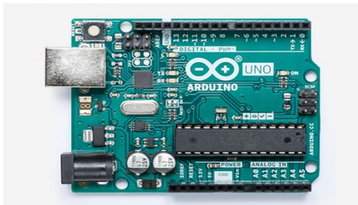
Fig.5 Arduino Uno with ATMEGA 328

The Arduino Uno is a microcontroller board based on the ATmega328 (shown in fig.5). Arduino is an open-source, prototyping platform. The Arduino Uno differs from all the other preceding boards that it does not use the FTDI USB-to-serial driver chip. Instead, it features the ATMEGA microcontroller chip programmed as a USB-to-serial converter. It contains everything needed to support the microcontroller.