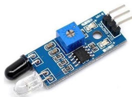
Fig.3 IR Sensor

An infrared sensor (shown in fig.3) is an electronic device, that emits in order to sense some aspects of the surroundings. An IR sensor not only measures the heat of the object but also the motion of the object. This type of sensors could measure infrared radiations only, rather than emitting it hence called as a passive IR sensor. IR sensor is used here for the purpose of detecting human beings.