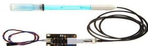
Fig-1: pH sensor