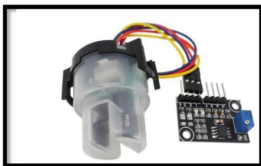
Fig-2: Turbidity sensor