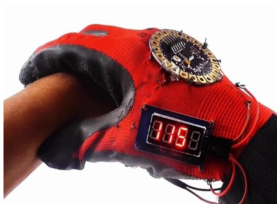
Fig. 3 Glove

In this project we are using Arduino micro controller to develop IoT based application. For elderly persons, Help to You (H2U) is developed that measures heart beats and blood pressure of the person is measured continuously. Pressure sensor measures the pressure and Systolic and diastolic pressure is calculated. The heart beats are measured by Heart beat sensor. If heart beats or Blood pressure become abnormal, SMS is sent to doctors or family members along with current location of that person. Location is tracked by using GPS modem. Buzzer also sounds at that time. The parameters of the person are displayed on the webpage that can be accessed from anywhere.