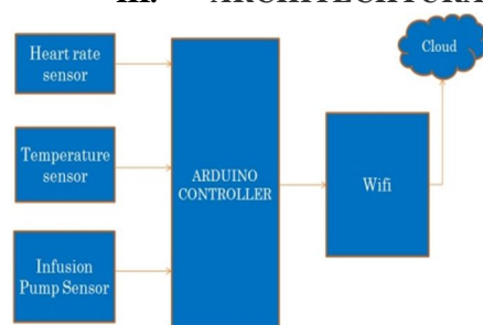
Fig 1: Architecture Diagram