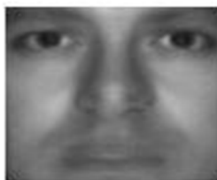
Fig2.Average of the set image

A new face recognition method based on PCA, LDA and neural network were proposed in method consists of four steps: