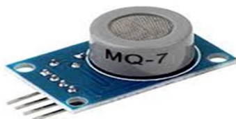
Fig. 4 CO2 Sensor