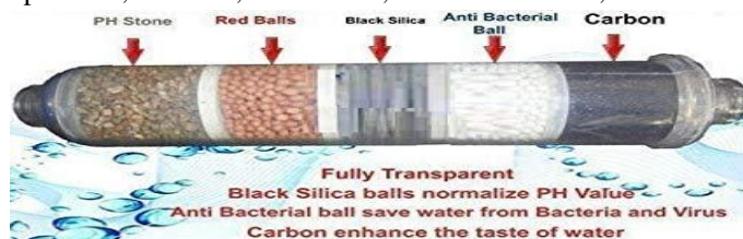
Fig. No. 5 Alkaline Membrane