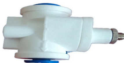
Fig. No. 3 TDS controller