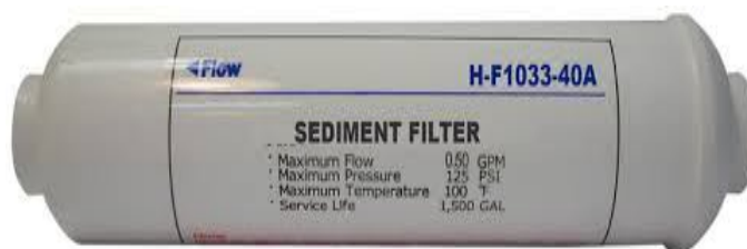
Fig. No. 2 Sediment Filter