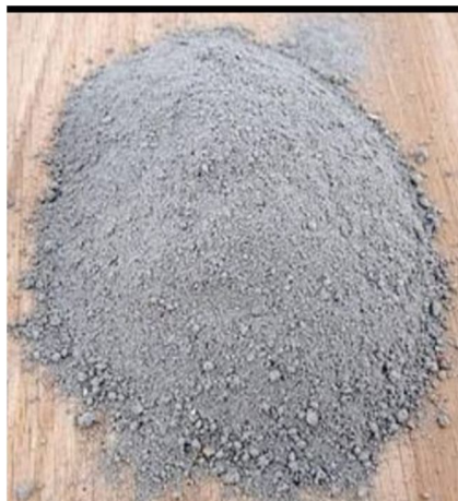
Fig:1 OPC grade 53 Cement

River sand zone II was used in this study.