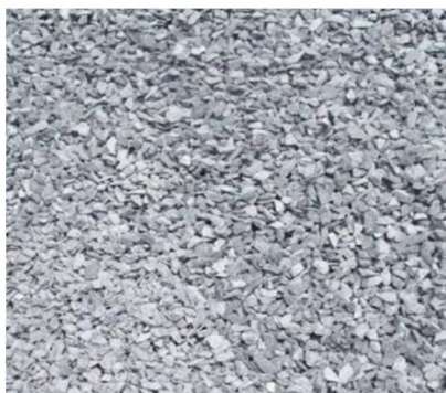
Fig 2:Coarse aggregate(10mm)

The coarse aggregate particles passing through 12.5mm and retained on 4.75mm IS sieve used as the natural aggregate which met the grading requirement of IS 383-1970