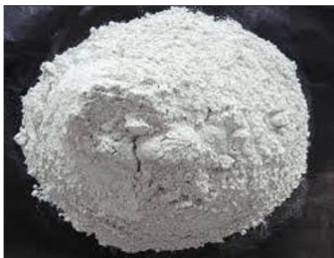
Fig 3: Ground granulated blast slag