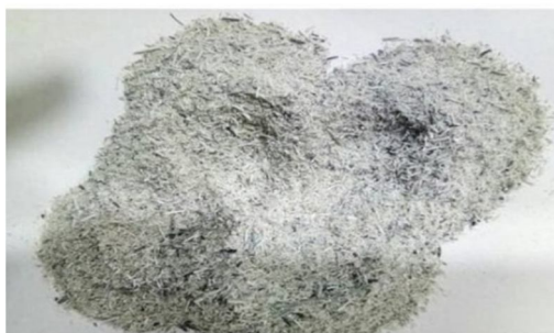
Fig 4: Rice husk ash

Rice husk is also known as rice hull is a by product of rice milling product the optimum.