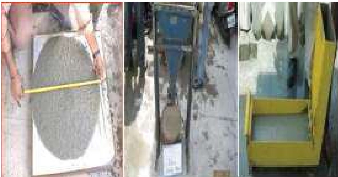
Fig. 1: Slump Flow, V-Funnel, L-Box Test