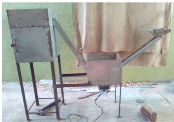
Fig 2 Waste plastic road making machine