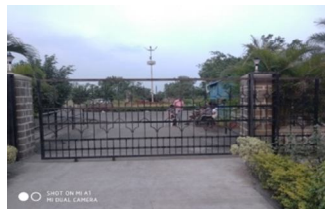
Fig 2. Automatic gate case study

Pravara Rural Engineering College's North campus gate has length of 6000mm and width of 2000mm and weight of 125 kilogram is under consideration for case study.