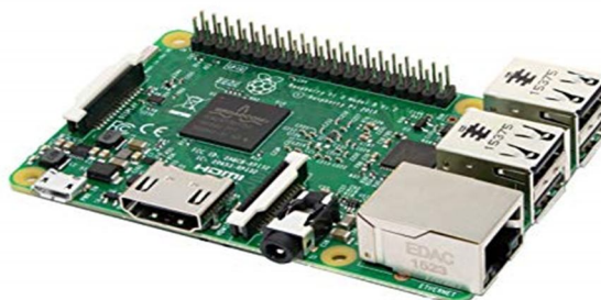
Fig No. 4.1 Raspberry Pi 3B Board