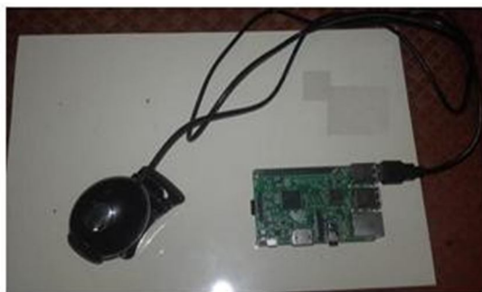
Fig (6) Hardware