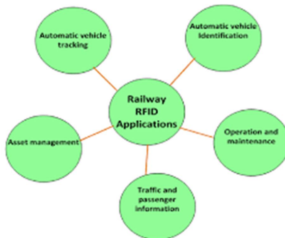
Figure 2.1.2 RFID Applications