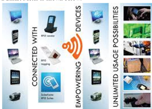
Figure 2.2 Smart usage

Smart Meter is an environmentally friendly energy meter that is used for measuring the electrical energy in terms of KWh (Kilowatt - hours). It is simply a device that affords a direct benefit to the consumers who want to save money on their electricity bill. [6] They belong to a division of Advanced Meter Infrastructure and are responsible for sending meter readings automatically to the energy supplier. A simple picture of a Smart Meter is shown below.