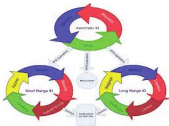
Figure 2.7 RFID operational flow

Three graphs for consumption, price-cost and cumulative cost on a particular day of a household, which are interesting for some specific reasons, are shown below. This is the first step of evaluating multiple graphs for further references