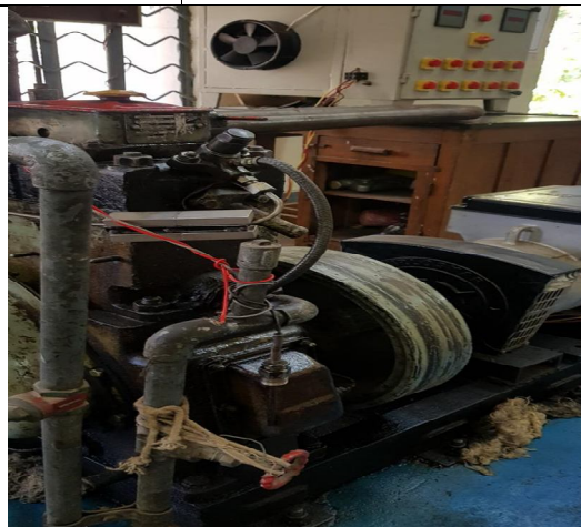
Fig2: Conventional diesel engine with magnetic field

Then, the performance of same engine with magnetic field by mounting 4 magnets (50mm x 25mm x 12.5mm) each of 1 Tesla strength on the fuel injector nearer to the combustion chamber was shown in table:4