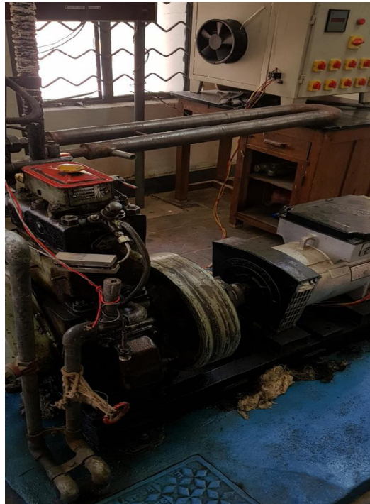
Fig 5: Diesel engine with magnet and EGR

The experiment is carried out by mounting both heat exchanger and magnetic field. Performance of the engine is as shown in table:6