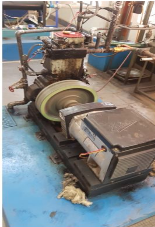
Fig1: Conventional four stroke Diesel engine

The experiment was conducted on a convectional 4-stroke single cylinder vertical, water cooled diesel engine with electrical dynamometer. The performance characteristics of the engine were as shown in table:3