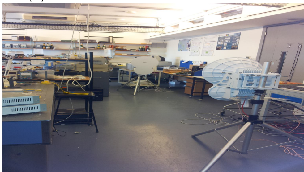
Fig 1:Experimental set up

During the measurement, the alignment of the TX and RX was maintained in height and Azimuth to ensure that the boresight of both antennas are on a straight line. The material under test was positioned perpendicularly such that the an orthogonal signal incidence of the wireless signal on the material is sustained. The report of measurement-based analysis of wireless signal attenuation of some building material in the indoor scenario is presented in this paper.