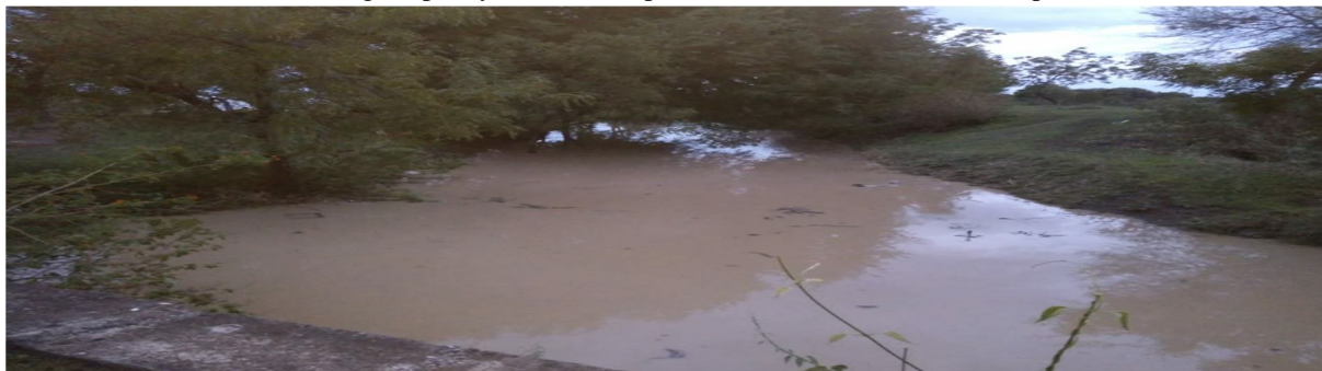
Figure 4: Nalla Widening and Deepening at Shingoli, Osmanabad

It was concluded that, from observations of structure this farm pond is constructed under the scheme 'Farm pond on demand'. It is really benefitted to farmers. Water storage capacity of this farm pond is 441 T.C.M. Size of farm pond is 25 \times 25 \times 3 .