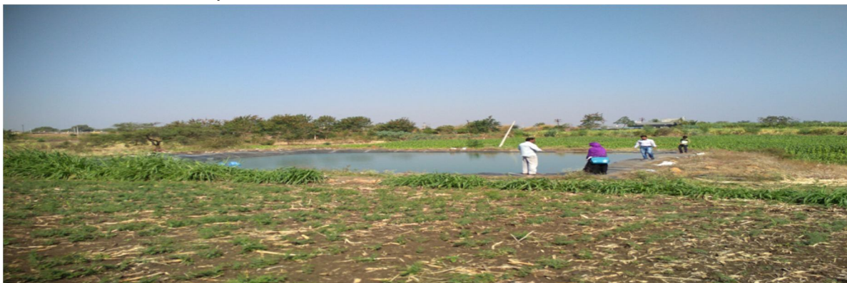
Figure 3: Observing Farm Pond At Shingoli, Osmanabad.

By, adopting this step by step procedure, we can easily choose villages which are really needful to implement the scheme jalyukta shivar campaign. That's why Government has prepared an organized action plan to make 'water for all-drought-free Maharashtra and to permanently overcome drought situation and implementing 'Jalyukya shivar' (water full surrounding) Campaign to increase water availability.