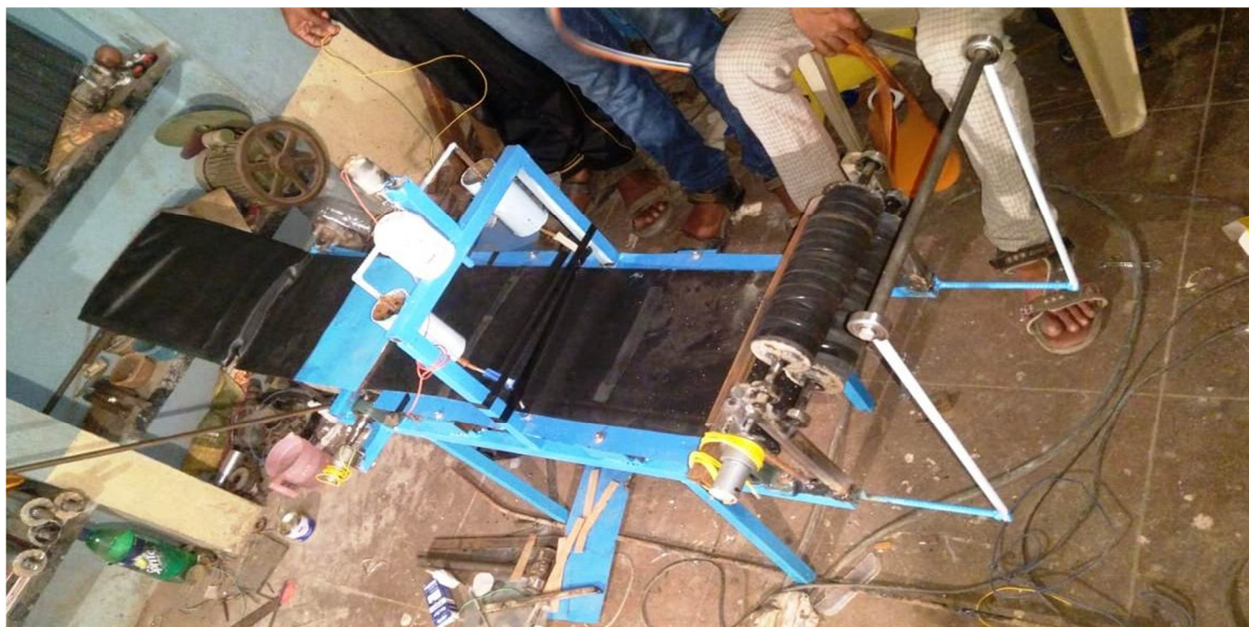
Fig 2: Final working model