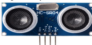
Fig.6 Ultrasonic sensor module

This sensor is used for detecting the obstacles on the way for the blind persons in this project. This sensor transmits an ultrasonic burst and correspondingly gives an output pulse based on the time required for the burst echo to return to the ultrasonic sensor. By this way depends on the echo pulse width, distance target is easily be detected and measured.