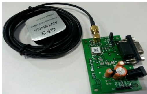
Fig.3 GPS module