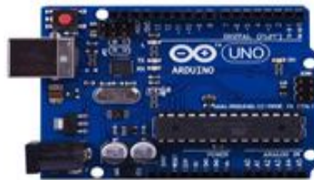
Fig.2 Arduino Uno board