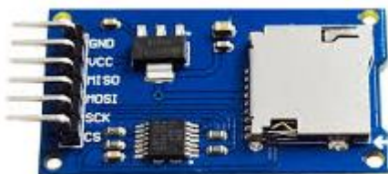
Fig.5 SD card module

It allows to read and write to the SD card using your arduino through programming. It is easily interfaced as a peripheral to the used arduino sensor shield module. It can be used for SD Card more easily, such as for MP3 Player, MCU/ARM system control With all SD SPI Pins out: MOSI, SCK, MISO and CS, for further connection Input Voltage: 3.3V/5V. The navigation directions are stored in audio format in the SD Card with the help of which the blind person gets the directions.