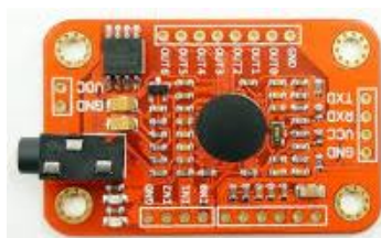
Fig.4 Voice recognition module (V3)

This product is a speaker dependent voice recognition module. It supports up to 80 voice commands in all. Max 7 voice commands could work at the same time. Any sound could be trained as command. Users need to train the module first before let it recognizing any voice command. This board has 2 controlling ways: Serial Port (full function), General Input Pins (part of function). General Output Pins on the board could generate several kinds of waves while corresponding voice command was recognized.