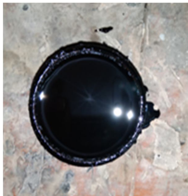
Fig 1. Bitumen Sample

Bitumen materials have been consistently used in road construction. In this study 80 – 100 grade bitumen was used same bitumen was used for all the mixes so the type and grade of binder would be constant. Asphalt also known as bitumen is a sticky, black, and highly viscous liquid or semi-solid form of petroleum. It may be found in natural deposits or may be a refined product, and is classed as a pitch .It has specific gravity of around 1.03