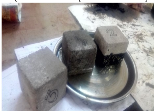
Fig 2. Sample kept in various exposure condition

The mortar cubes were Oven dried so as to be free from any water content in their pores . After kept for 24 hours in different exposure conditions , initial weight and weight after 24 hours of exposure is noted and is represented below in table .