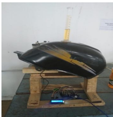
Fig.5 50ml of petrol filled in flask