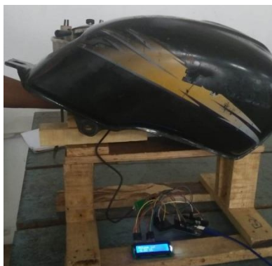
Fig.3 Reading of empty tank