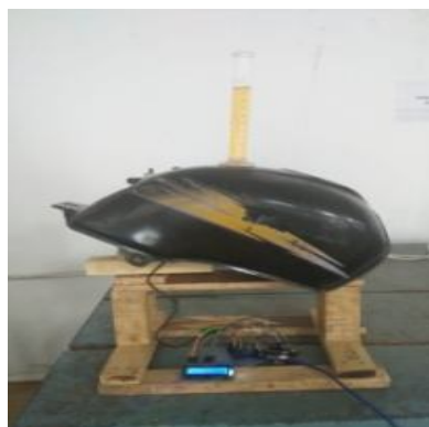
Fig.6 100ml of petrol filled in flask