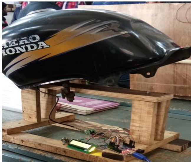
Fig.3 Experimental Setup

In our project first of all we made a circuit by interfacing load cell, arduino uno, HX711 module, and made the initial code to run appropriately using arduino software and find out the calibration factor for the load cell based on the weight placed by considering density of the petrol used. Finally we have to make it visualize in LCD module so, we followed another circuit connection between arduino and lcd module along with bread board and used an 10k controller to adjust the contrast in LCD module. In order to make the LCD work another program between HX711 module and LCD module was dumped into the arduino uno. Thus this code is the final code for volume measurement.