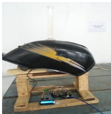
Fig.4 Mounting of measuring flask on tank