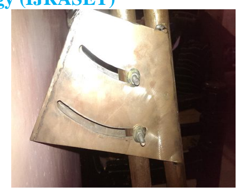
Guide with Slots