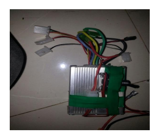
Fig. 6: Motor Controller