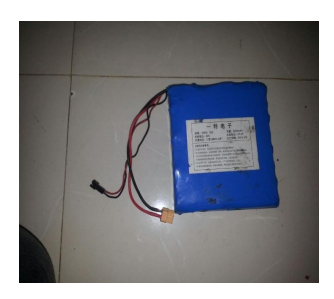
Fig. 5: Li-ion Battery

Lithium-ion batteries are most commonly used type of rechargeable batteries as they are compact, lightweight, provide the same voltage as compared to the heavy lead acid batteries and there is slow loss of charge when they are not in use. Here we have used 2.2 Ah battery as we wanted more compactness and less weight. To increase the range of the bike, higher capacities of Lithium Ion batteries can be used; but the weight of the bike as well as the cost will increase.