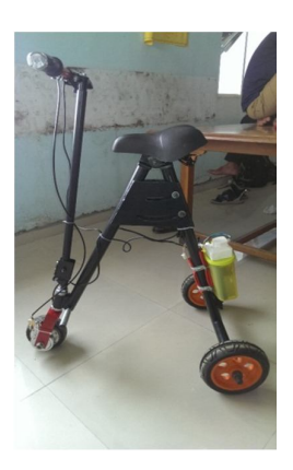
Fig. 7: Electric Commuter Bike

The Electric Commuter Bike is driven by BLDC Hub Motor fitted in the front axle and is operated by battery power. The speed of the E-Bike is controlled by means of twist throttle which will vary the amount of current passing through the controller and hence to the hub motor. As per our design, the weight is more on the back side as compared to the front. So the center of gravity is shifted to the back side. Hence a stand is provided to balance the center of gravity because of which no load acts on the motor at folded position. The key feature of the E-Bike is that it can be folded by means of folding arms which helps it to be accommodated in situations where it is not in use.