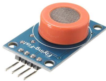
Fig.4: MQ3 Sensor