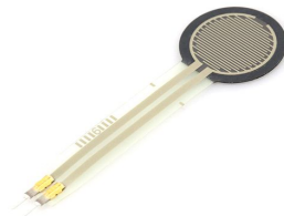
Fig.5: Force sensing resistor