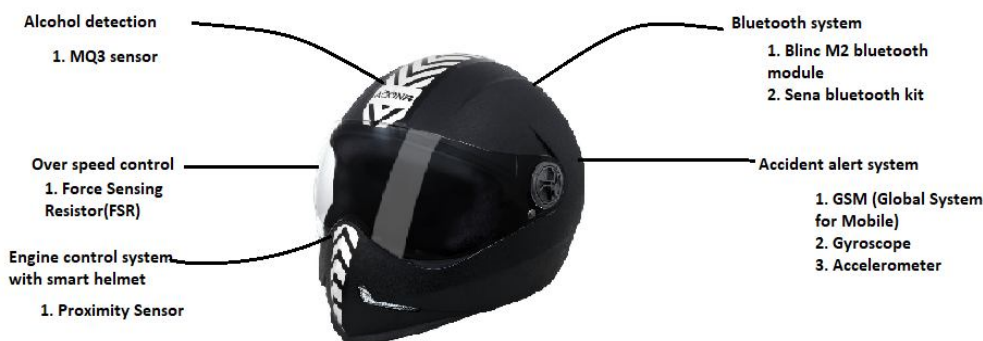
Fig.1: Smart Helmet Model