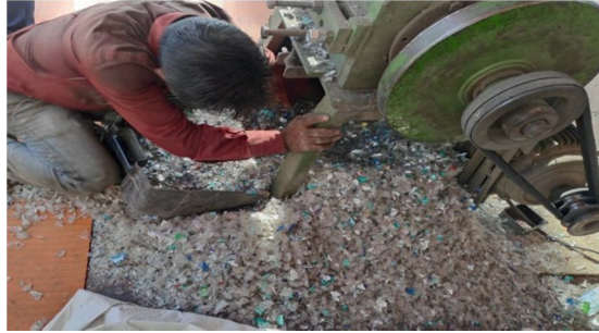
Figure5 Waste plastic bottles crush