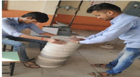
Figure11 Sieve Analysis Test

A sieve analysis is a procedure to use to assess the particle size distribution of a granular material by allowing the material to pass through a series of sieves of progressively smaller mesh size and weighing the amount of material that is stopped by each sieve as fraction the whole mass.