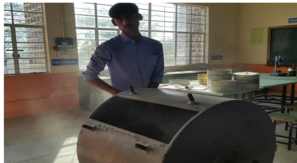
Figure 12 Los Angeles Abrasion test

Los Angeles Abrasion Test on aggregate is the measure of aggregate toughness and abrasion resistance such as crushing, degradation and disintegration. This test is carried out by AASHTO T 96 or ASTM C 131: Resistance to Degradation of small size coarse aggregate by abrasion and impact in the Los Angeles machine