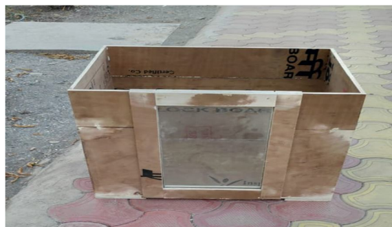
Figure 4 Model of Permeable Pavement