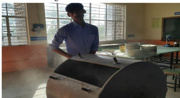
Figure 12 Los Angeles Abrasion test

Los Angeles Abrasion Test on aggregate is the measure of aggregate toughness and abrasion resistance such as crushing, degradation and disintegration. This test is carried out by AASHTO T 96 or ASTM C 131: Resistance to Degradation of small size coarse aggregate by abrasion and impact in the Los Angeles machine