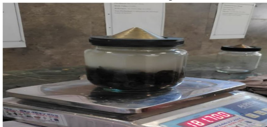
Figure9 Specific gravity test by Pycnometer

Specific gravity test by Pycnometer the Pycnometer is used for determination of specific gravity of aggregate. The determination of specific gravity of aggregate will help in the calculation of void ratio, degree of saturation and other different aggregate properties.