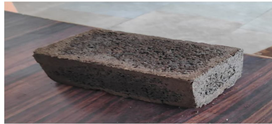
Figure 8 Paving block after removing mould