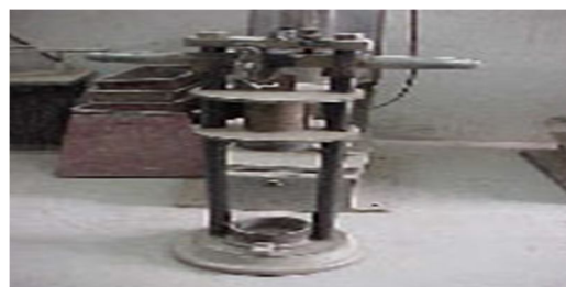
Figure10 Impact Test machine

Toughness is the property of a material to resist impact. Due to traffic loads, the road stones are subjected to the pounding action or impact and there is possibility of stones breaking into smaller pieces. The road stones should therefore be tough enough to resist fracture under impact. A test designed to evaluate the toughness of stone i.e., the resistance of the stones to fracture under repeated impacts may be called an impact test for road stones