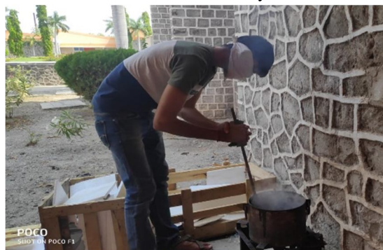
Figure 6 Melting waste plastic

Plastic wastes are heated in a metal bucket at a temp of above 150°. As a result of heating the plastic waste melt. The materials aggregate and other materials as described in previous chapter are added to it in right proportion at molten state of plastic and well mixed. The metal mould is cleaned through at using waste cloth. Now this mixture is transferred to the mould. It will be in hot condition and compact it well to reduce internal pores present in it. Then the blocks are allowed to dry for 24 hours so that they harden. After drying the paver block is removed from the moulds and ready for the use.