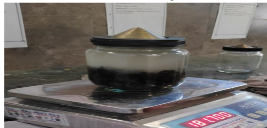
Figure9 Specific gravity test by Pycnometer

Specific gravity test by Pycnometer the Pycnometer is used for determination of specific gravity of aggregate. The determination of specific gravity of aggregate will help in the calculation of void ratio, degree of saturation and other different aggregate properties.