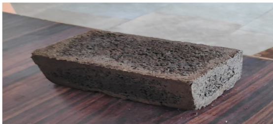
Figure 8 Paving block after removing mould