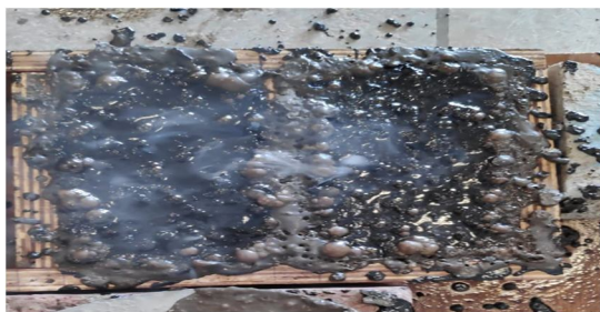
Figure 7 Hot mix poured in mould