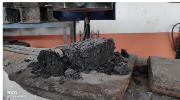
Fig. Compressive Test on Paving Block on UTM