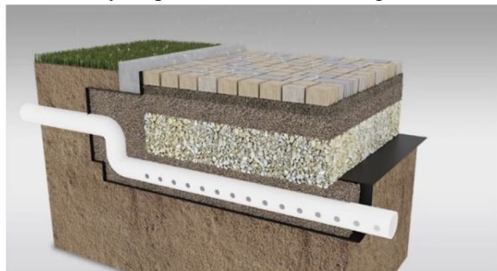
Figure 3 Cross section of permeable pavement with infiltration pipe

Over a 20-year period, PICP's are designed to achieve and maintain a consistent 3in/hr.