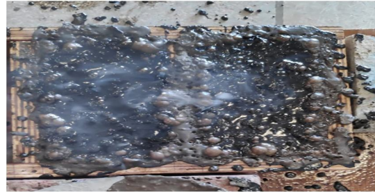
Figure 7 Hot mix poured in mould