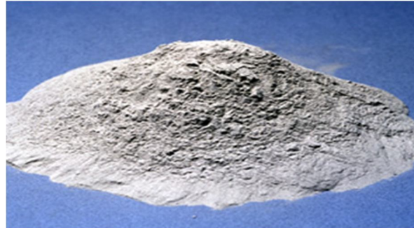
Fig 1: flyash cement

Flyash is defined in Cement and Concrete Terminology as “the finely divided residue resulting from the combustion of ground or powdered coal, which is transported from the firebox through the boiler by flue gases.” Flyash is a by-product of coal-fired electric generating plants. Flyash is one of three general types of coal combustion byproducts (CCBP’s). The use of these byproducts offers environmental advantages by diverting the material from the wastestream, reducing the energy investment in processing virgin materials, conserving virgin materials, and allaying pollution. Thirteen million tons of coal ash are produced in Texas each year. Eleven percent of this ash is used which is below the national average of 30 %. About 60 – 70% of central Texas suppliers offer flyash in ready-mix products. They will substitute flyash for 20 – 35% of the portland cement used to make their products. Although flyash offers environmental advantages, it also improves the performance and quality of concrete.