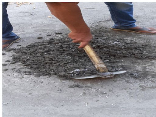
Fig.(g): Mixing of materials