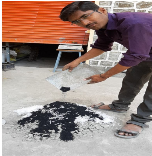
Fig(f): Addition of treated Crumb Rubber and Synthetic Fibre in concrete.

It is an effective treatment method for making a homogenous mixture, that rubber particles are evenly distribute. Also, this method results in the formation of better bond between rubber and cement paste in concrete. The major problem associated with the direct addition of rubber into the concrete mixture is the tendency of rubber particles to trap air bubbles, which are clinging to them. During the period of 24 h of water-soaking the trapped air bubbles, which are attached to rubber particles can get enough time to release gradually and the observed rubber hydrophobic behaviour can significantly be resolved. It was observed that just after addition of rubber to the container of water most of the particles (roughly over 50% of rubber particles) were floating on water, but gradually after 24 hrs. most of them were sunk to the bottom of the container. The mixture of rubber and water is full of air bubbles; however, after 24 h most of the entrapped air bubbles were released from the mixture. . In addition, stirring the mixture of rubber and water facilitated releasing of the entrapped air bubbles to be detached and release from the mixture.