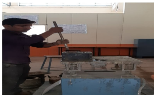
Fig.(h): Casting and Compaction of cubes