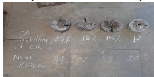
Fig (b): No. of blows at the age of 7 days

To study the impact strength of concrete circular disc specimen of size 150 mm diameter and 50mm depth were cast and test was conducted after 28 days of curing by using drop weight impact test equipment. Circular disc specimen mould of 150mmø with a depth 50mm was made from PVC pipes. The moulds were placed over hard platform and concrete mix was filled in the mould with proper compaction. After 24 hours specimens were demoulded and kept in curing tank for 7 days and 28 days.