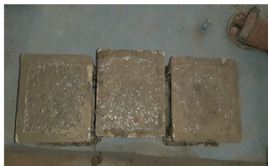
Fig(e): Casting of cubes for compressive strength test at the age of 28 days.