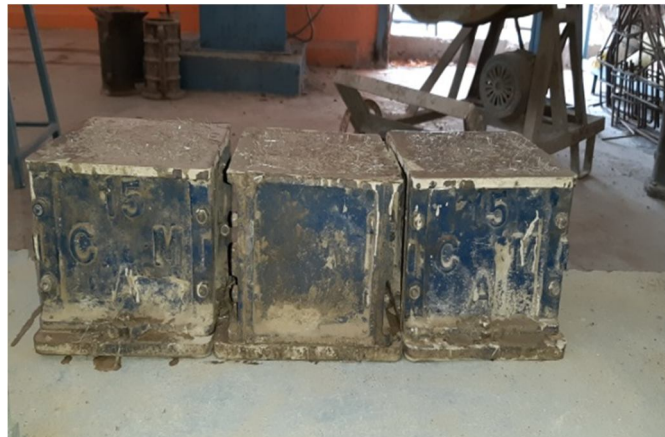
Fig(d): Casting of cubes for compressive strength test at the age of 7 days

With the constant water-cement ratio, the compressive strength showed a decreasing trend when percentage of crumb rubber increased. This loss in strength is mainly due to lack of adhesion between rubber particles and cement paste.