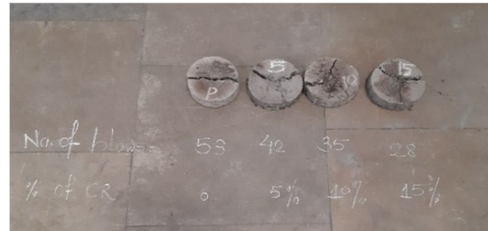
Fig (c): No. of blows at the age of 28 days

Three circular disc specimen were cast with normal concrete are referred as control specimen. The other three groups were made of concrete with partial replacement of crumb rubber particles to the fine aggregate in concrete at varying percentages from 5% to 15%. In each group for every percentage replacement of crumb rubber 3-disc specimen were cast. Hollow tubular of concrete were cast with different groups and with varying percentages of waste tyre crumb rubber particles from 5% to 15% and the sizes of crumb rubber particles.