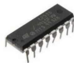
Figure 3. ICL293D

2) Motor Driver IC L293D : It is a typical Motor driver or Motor Driver IC which allows DC motor to drive on either direction. L293D is a 16-pin IC which can control a set of two DC motors simultaneously in any direction. It means that you can control two DC motor with a single L293D IC. It works on the concept of H-bridge. H-bridge is a circuit which allows the voltage to be flown in either direction. As you know voltage need to change its direction for being able to rotate the motor in clockwise or anticlockwise direction, Hence H-bridge IC are ideal for driving a DC motor. In a single L293D chip there are two h-Bridge circuit inside the IC which can rotate two dc motor independently. Due its size it is very much used in robotic application for controlling DC motors. There are two Enable pins on l293d. Pin 1 and pin 9, for being able to drive the motor, the pin 1 and 9 need to be high. For driving the motor with left H-bridge you need to enable pin 1 to high. And for right H-Bridge you need to make the pin 9 to high. If anyone of the either pin1 or pin9 goes low then the motor in the corresponding section will suspend working. It's like a switch.