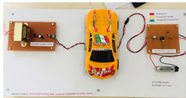
Figure No. 6.1: Experimental Model