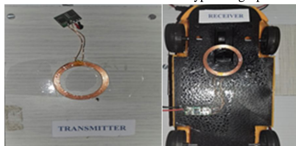
Figure 5.1: Transmitter coil Figure.5.2: Receiver coil