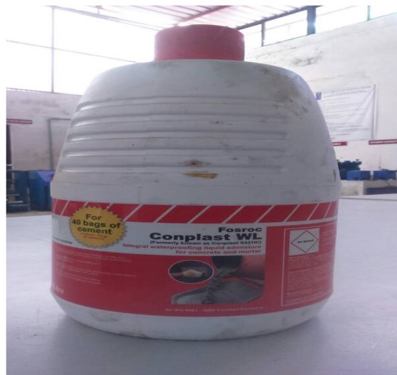
Fig.3.2. Super Plasticizer

The admixture are composed primarily of those which increase and also those which slow down hydration or setup of the concrete, carefully split products which boosts workability, water proofers, pigments, moistening, distributing as well as air-entraining representatives and also pozzolonas. Admixtures varying from enhancements of chemicals to lose products have actually been utilized to boost specific homes of concrete. The admixture is typically included a reasonably minute amount. The level of control has to be greater to make certain that over does are not likely to take place. Excess amount of admixture might be damaging to the buildings of concrete. It might be stated below that concrete of bad amount will certainly not be transformed to the top quality concrete by including admixture.