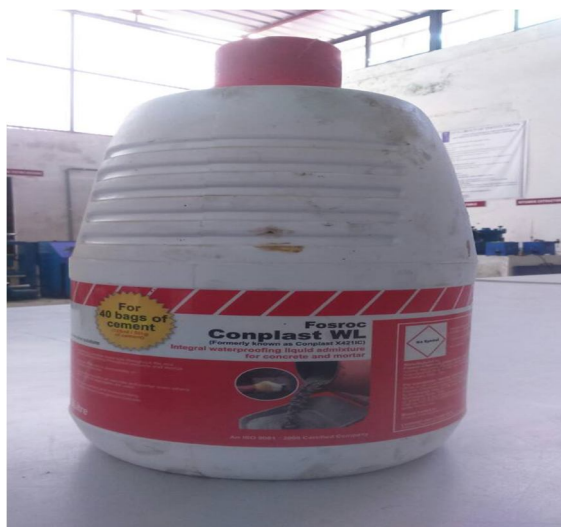
Fig.3.2. Super Plasticizer

The admixture are composed primarily of those which increase and also those which slow down hydration or setup of the concrete, carefully split products which boosts workability, water proofers, pigments, moistening, distributing as well as air-entraining representatives and also pozzolonas. Admixtures varying from enhancements of chemicals to lose products have actually been utilized to boost specific homes of concrete. The admixture is typically included a reasonably minute amount. The level of control has to be greater to make certain that over does are not likely to take place. Excess amount of admixture might be damaging to the buildings of concrete. It might be stated below that concrete of bad amount will certainly not be transformed to the top quality concrete by including admixture.