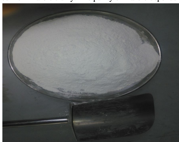
Fig.3.1. Marble power.