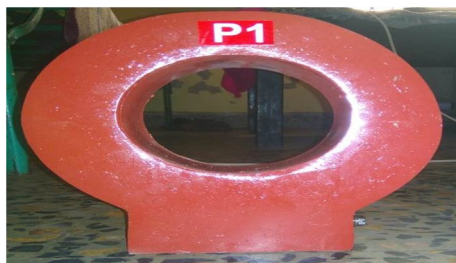
Fig.1 Photograph of experimental set up