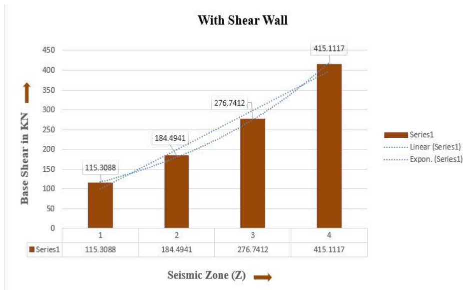
Graph 1: - Base Shear (Story wise) with shear wall