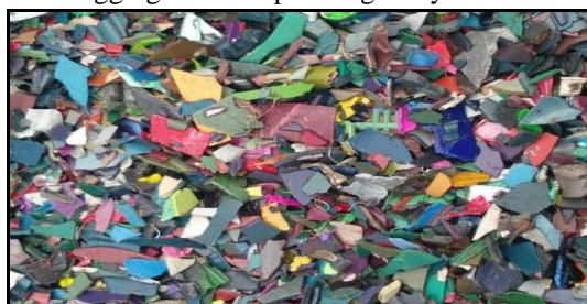
Fig. 2 Plastic chips