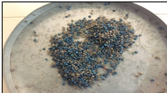
Fig. 1 Plastic granules