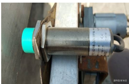
Fig. 2 : Proximity sensor

A proximity sensor is a sensor able to detect the presence of nearby objects without any physical contact. A proximity sensor often emits an electromagnetic field or a beam of electromagnetic radiation (infrared, for instance), and looks for changes in the field or return signal. The object being sensed is often referred to as the proximity sensor's target. Different proximity sensor targets demand different sensors. For example, a capacitive proximity sensor or photoelectric sensor might be suitable for a plastic target; an inductive proximity sensor always requires a metal target.[citation needed]