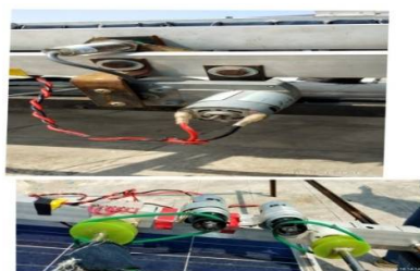
Fig 3: Actual Mechanism