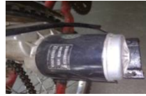
Fig. 2.1. DC Motor

Current Rating: 14.53 amp Speed: 1800 rpm