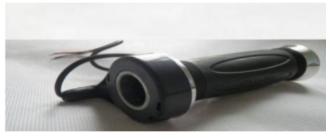
Fig. 2.6 Throttle