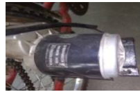
Fig. 2.1. DC Motor

Current Rating: 14.53 amp Speed: 1800 rpm