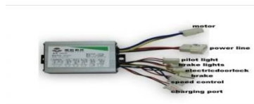
Fig. 2.3 Controller