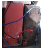
Fig. 2.2 Battery