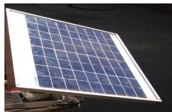
Fig. 2.4 Solar Panel