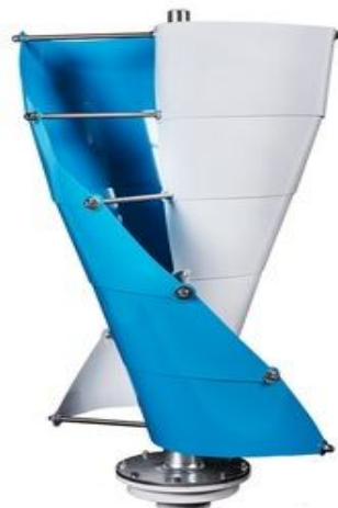
Fig2: Airfoil Wind Turbine

The Vertical-Axis Wind Turbine (VAWT) is a wind turbine that has its main rotational axis oriented in the vertical direction.