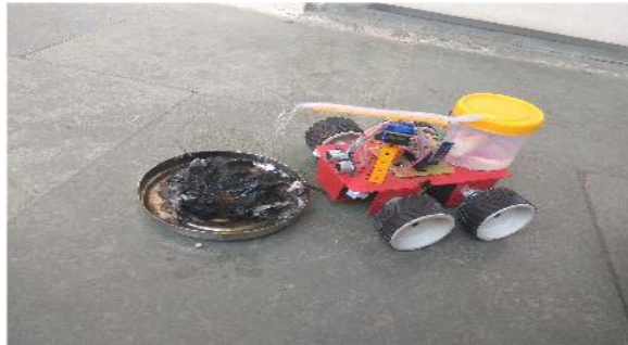
Figure 4: Robot extinguishing fire.

In above diagram the robot is detecting fire and as soon as fire is detected the robot puts it off.