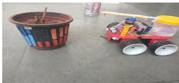
Figure 3: Robot avoiding obstacle. In above diagram the robot is avoiding the obstacle and is moving safely.