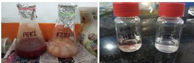
Fig. 3. Stock solutions (left) and Working solutions (right) of Flesh and Shell extracts