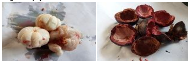
Fig. 2. Flesh (left) and Shells (right) of Mangosteen fruits

The four mangosteen fruits were washed thoroughly and dried in aseptic conditions. Using a clean and methanol rinsed cutlery the shells of the mangosteens were removed carefully without piercing the flesh of the fruits. After removing the skin, the flesh of the fruits which amounts 56.70g was taken in a clean conical flask and the shells which amounts 30.30g was taken in another flask. Both flesh and shell were suspended separately in 100 mL of distilled water. The aqueous extracts of the mangosteen fruit were incubated overnight at the room temperature, which were the stock solutions. The working solutions were prepared by filtering the aqueous extracts of flesh and shell using filter paper.