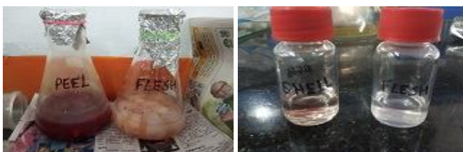
Fig. 3. Stock solutions (left) and Working solutions (right) of Flesh and Shell extracts