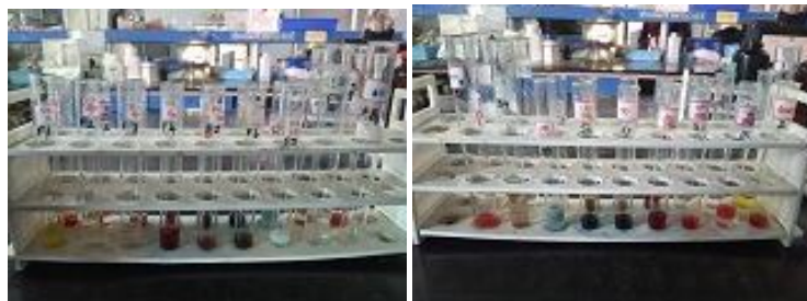
Fig. 5. Phytochemical analysis samples of Flesh (left) and Shell (right) extracts after the addition of reagents