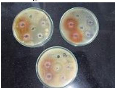
Fig. 4. Zones of Inhibition of Flesh and Shell extracts along with standard tetracycline to the bacterial species such as S. aureus (top left), E. coli (top right), P. vulgaris (bottom)

The flesh and shell extracts were condensed in a hot stirrer and then dissolved in DMSO (Dimethyl Sulfoxide). Nutrient agar, having the composition of Peptone-5g, Yeast extract-3g, NaCl-5g, distilled water-1000 mL, agar-20g at pH 7, was melted by subjecting to heat. The melted nutrient agar was poured into three sterilized petri dishes in aseptic condition. The plates were kept aside for the nutrient agar to solidify. After solidification, the sample bacterial cultures such as S. aureus (Gram positive), E. coli (Gram negative), P. vulgaris (Gram negative) were taken and swabbed separately over the three different plates. In each plates, 6 wells were made in which one was the control well with no extract samples or standard, other one was filled with 30 \mu\text{L} of tetracycline as positive control, other two were filled with 375 \mu\text{L} and 500 \mu\text{L} of shell extract, remaining two were filled with 375 \mu\text{L} and 500 \mu\text{L} of flesh extract. The plates were then incubated overnight in aseptic condition. After incubation, the zones of inhibition of each samples in the plates were measured using zone scale.