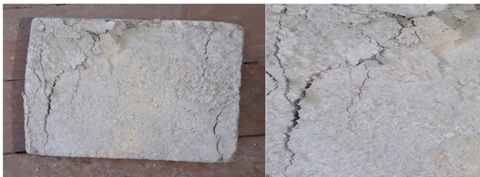
Fig. 3 Concrete cube after compression testing.