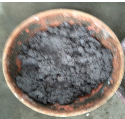
Fig. 2 After prepare paper pulp.