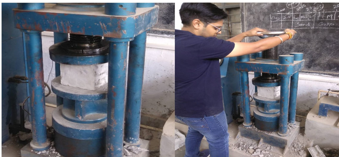
Fig. 3 Concrete cube under compression testing.