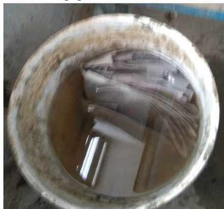
Fig. 1 Soaked paper waste

The paper waste quantity increased in four trials, such as T-1, T-2, T-3 and T-4. This corresponds to 0%, 5%, 10%, and 15%. Newly mixed concrete's properties were observed and test specimens were cast for assessment of concrete durability. Each percentage increase in paper waste was tested at seven days and 28 days after treatment for three cube specimens for compressive strength and water absorption. Determined that the compressive strength of normal concrete and special concrete in a different temperature in a 0° C to 250° C of various four tries 0%, 5%, 10%, 15% at 28 days of curing. Then find out the cost of production of concrete by different mixes of fly ash and waste paper.